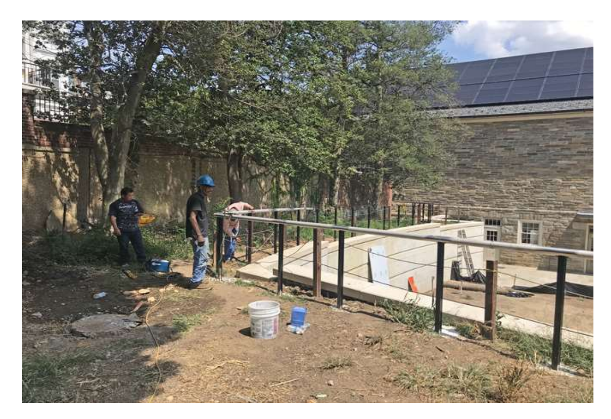
Even the architects are surprised by how prominent it turns out to be - a slight oversight in specification. We will pretend it was intentional.

Iron workers begin to wrangle, bend, and weld a sweeping stainless steel rail across the top of the retaining wall.