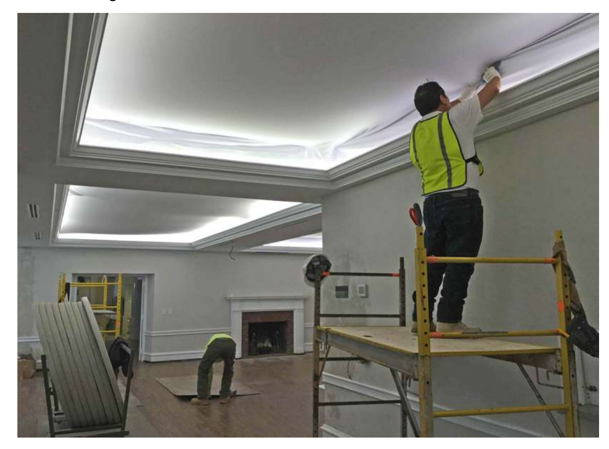
It's quite stretchy. Picture giant yoga pants.

In the Assembly Room, the ceiling crew finishes the acoustic insulation and the white fabric covering billows out.