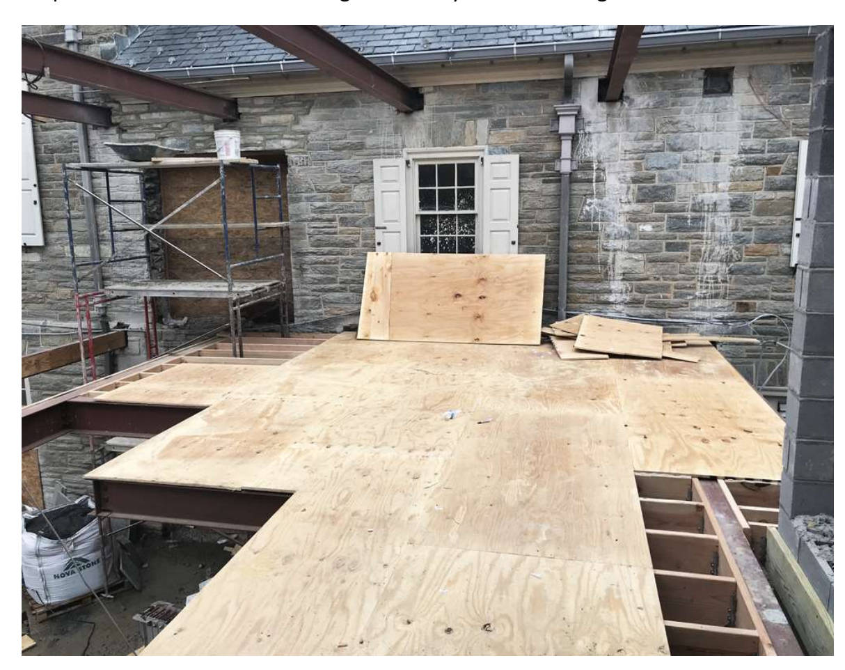
The connector finally connects!

Carpenters extend the deck through the Lobby to the Meeting House.