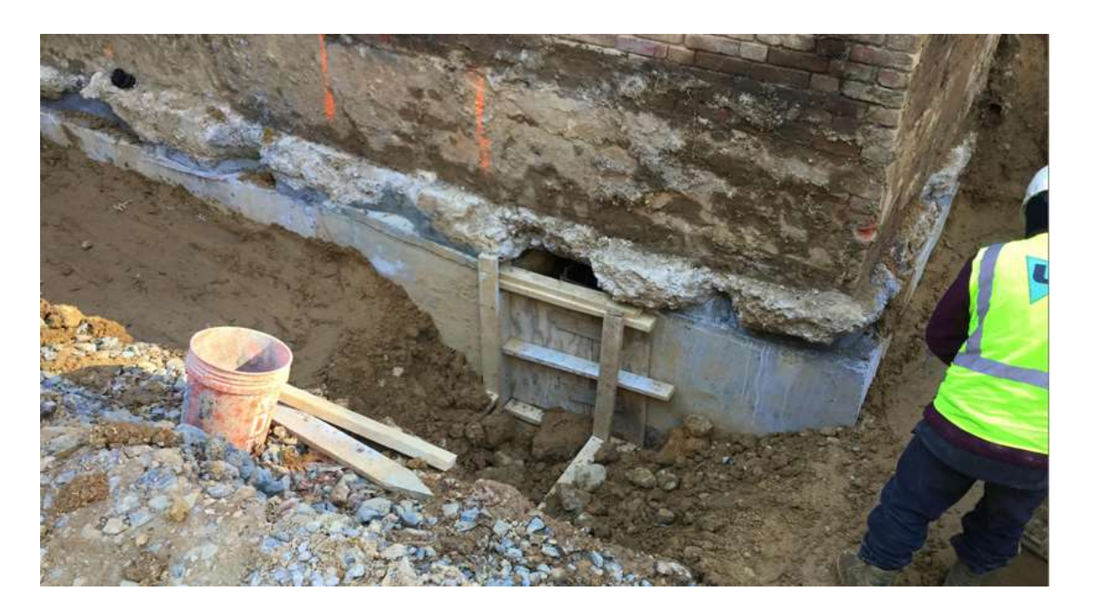
and create walls for the west stairs.