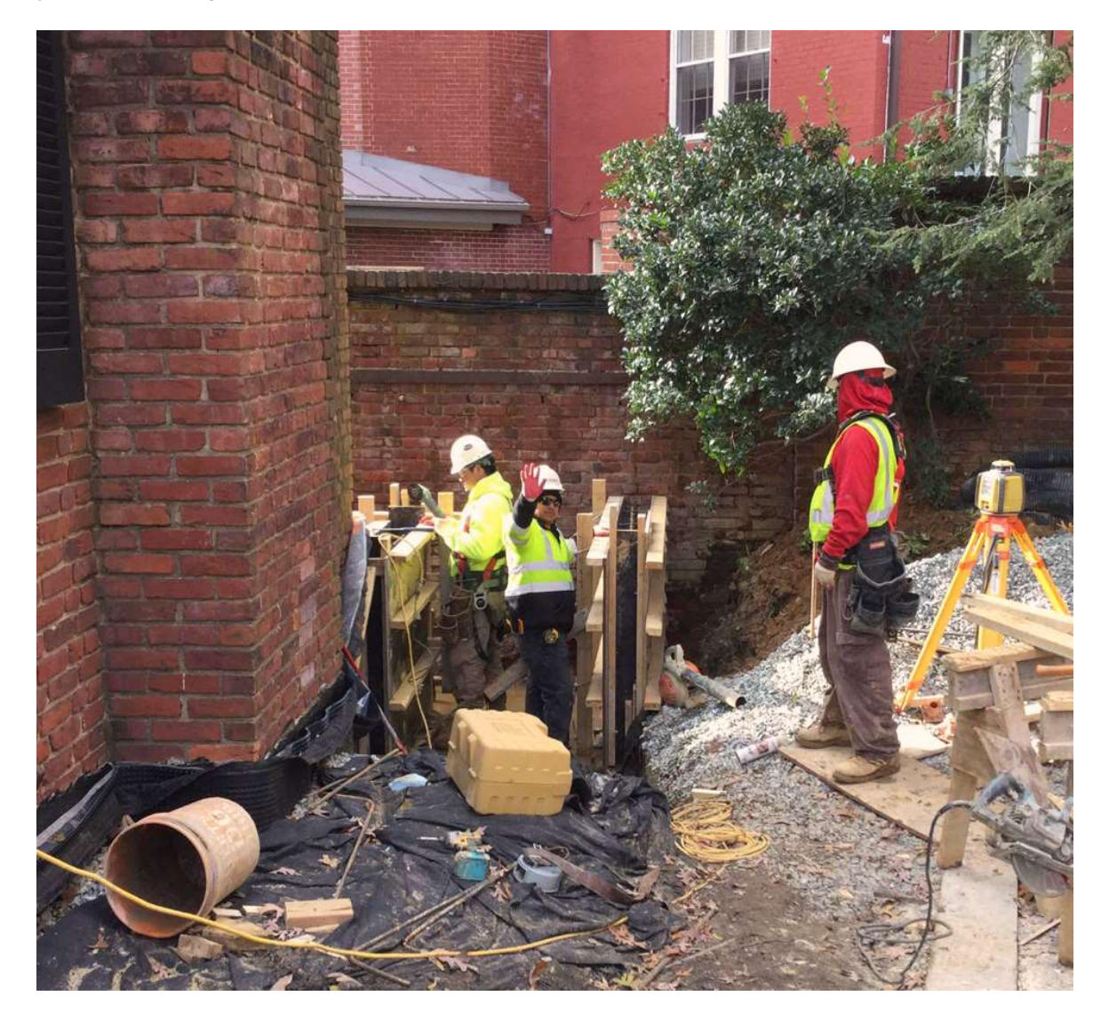
They also do assorted patching and cleanup of earlier work around the site.

The concrete crew prepares forms for the west stairwell walls on top of the already poured landing.