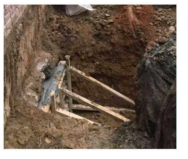
By day's end, steel and forms are placed and concrete is poured.

The underpinning begins with the digging of several holes under the Carriage House east wall.