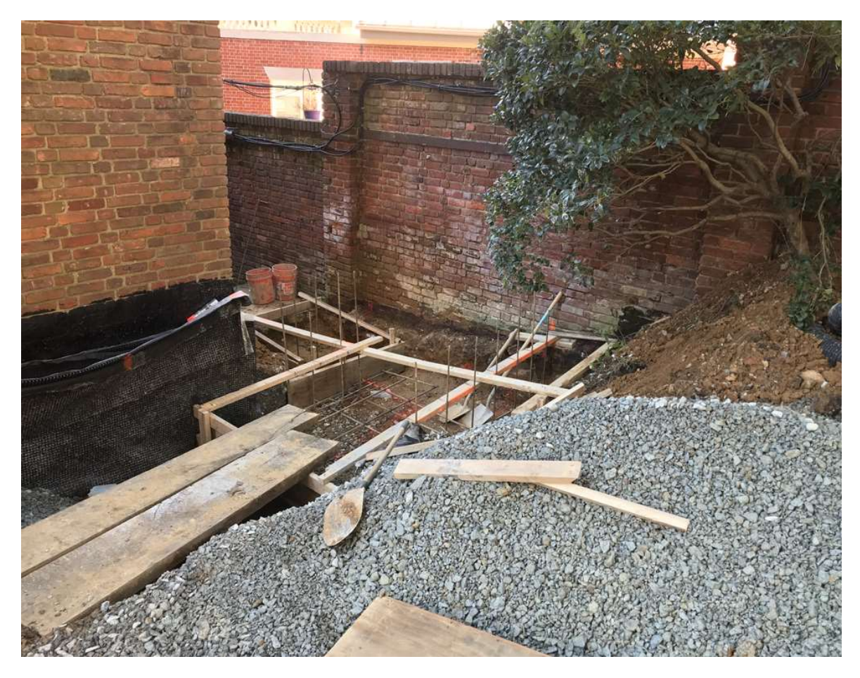
The black waterproofing on the wall shows where the new ground level will be. The orange buckets show where the bottom of the stairs will begin.

The concrete crew begins to set forms and steel to pour the foundation for those stairs.