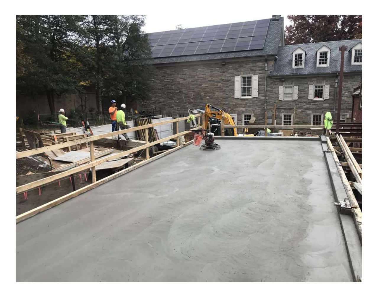
They also provide a new floor for the Janitor's Room.

The concrete crew pours the roof of the Storage Room, which now also possess four walls and a floor. Almost a room.