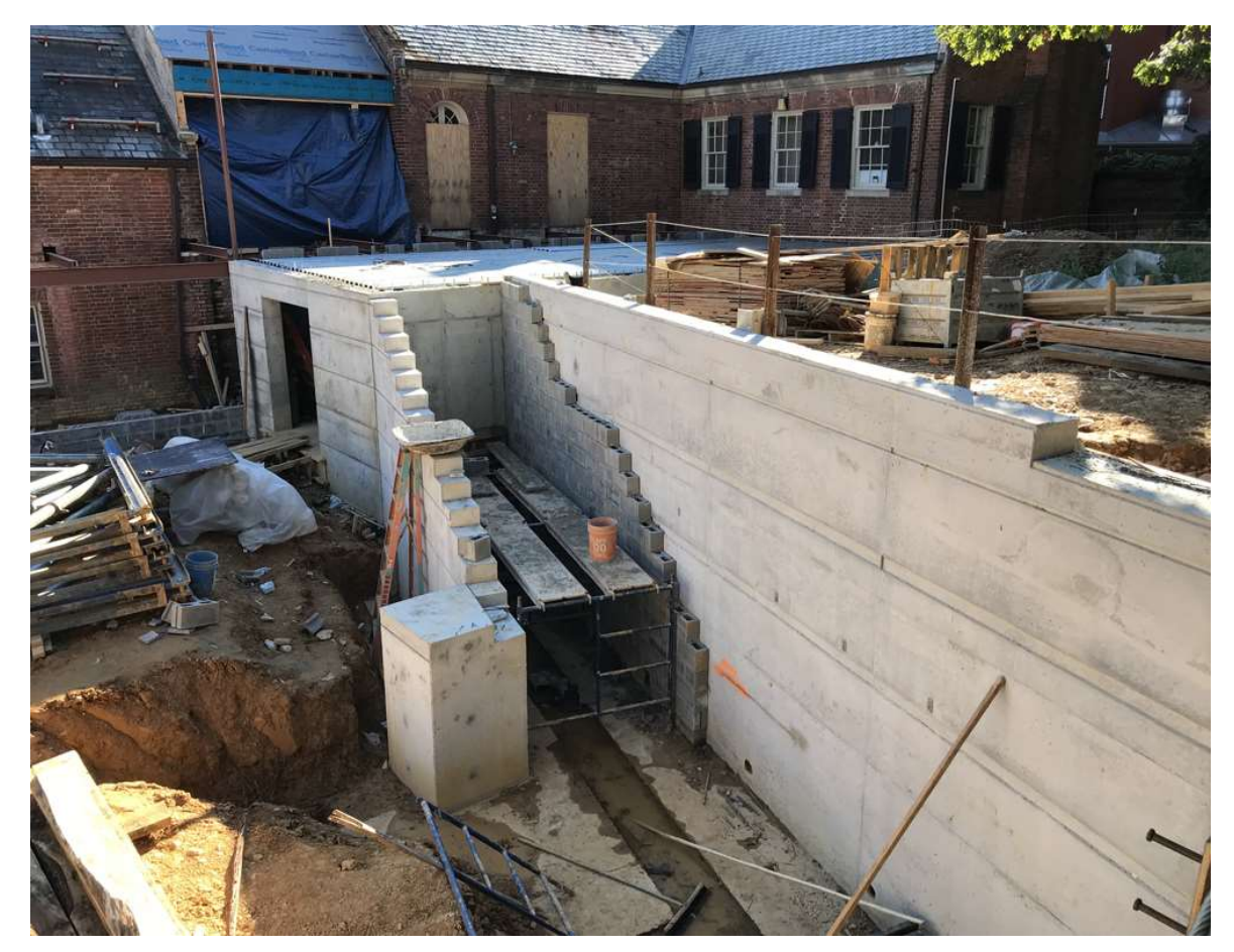
The Quaker House doors on the upper level will open onto a foyer space with two sets of double doors opening onto the brick patio and grass and trees on the right.

As shadows fall, the outlines of the new Quaker House Terrace are visible.