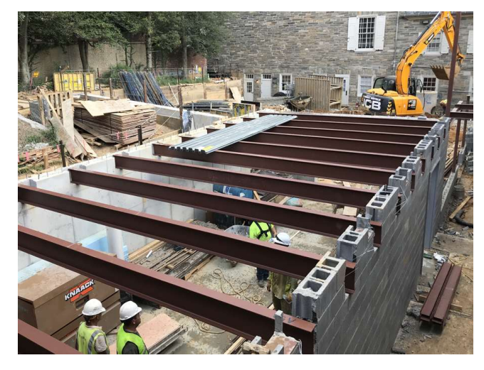
Now the beam pockets and bearing plates installed by the masons are put into service.

On the left, ironworkers unload beams and install them on the Storage Room roof, which will also be the Quaker House brick patio.