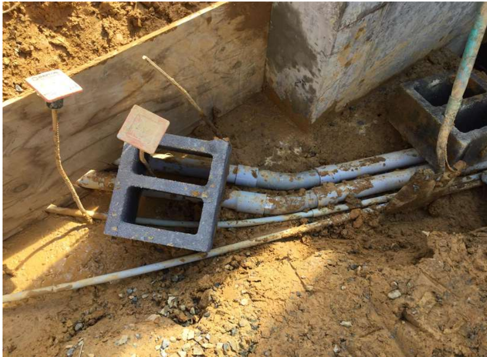
Three electricians install soon-to-be buried conduit to feed future outdoor lights.

Three plumbers continue to assemble copper pipes for Quaker House and Carriage House rooms.